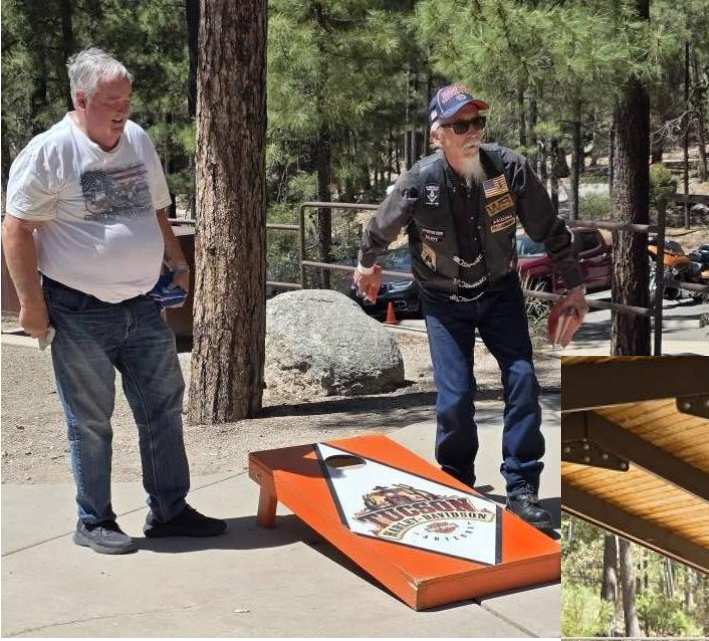
THE FINAL ROUND!