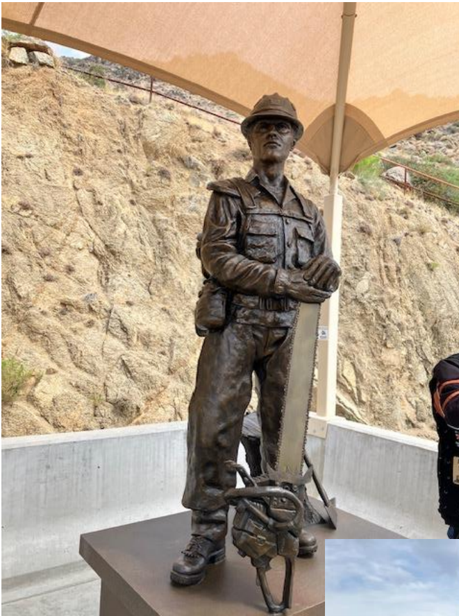
← Monument to the Granite Mountain Hotshots team on Highway 89 between Prescott and Wickenburg