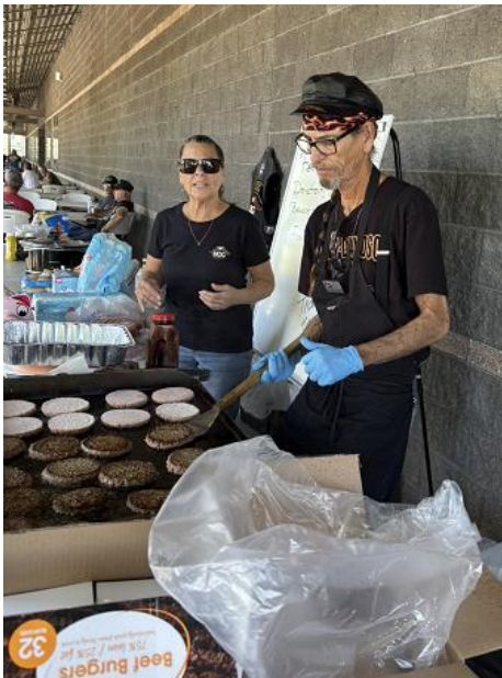
Firing Up the Grill