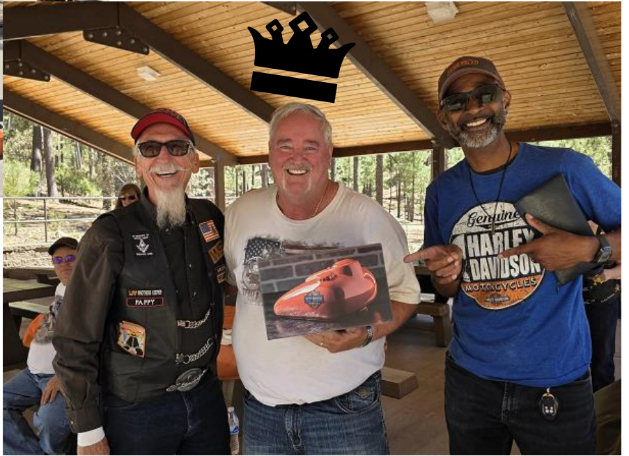
Sommerville Wins Cornhole Championship Pappy Fights Valiantly but Finishes Second