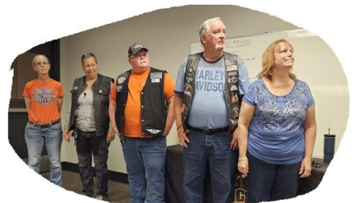
Thanks go to the HOG Board - Yeay!