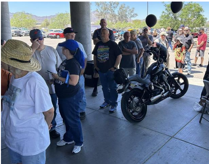
Line of Hungries