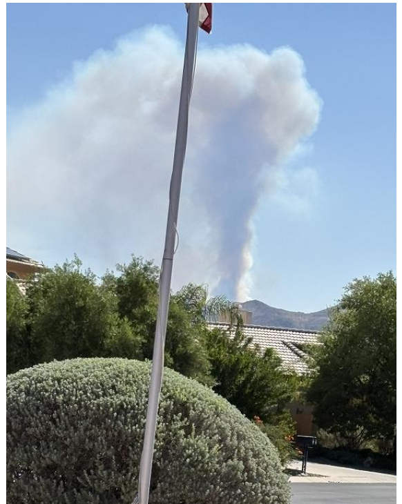
The Cody Fire Peeks Over the Hills