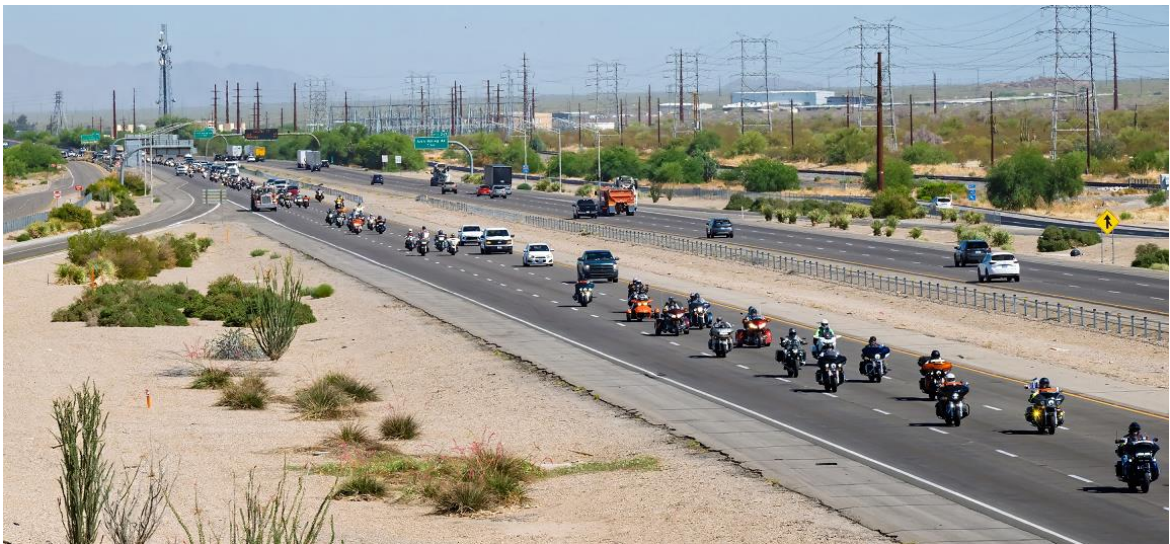
Bikes Thunder Through Marana