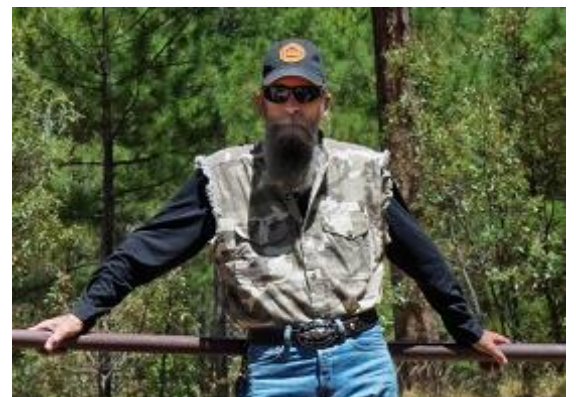
Volunteer Winner and Chief Coffee Maker