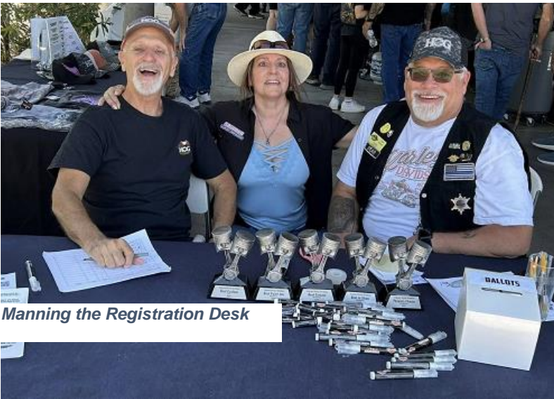
Manning the Registration Desk