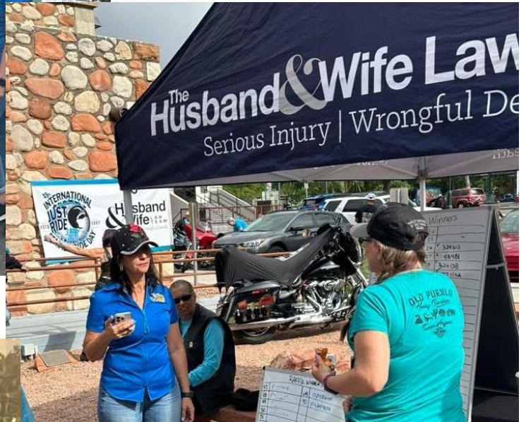
Husband & Wife Law Firm Sponsors IWRD