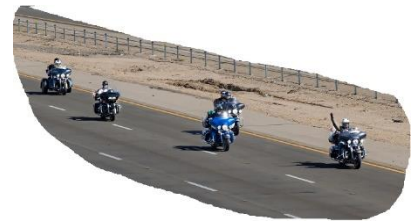
HOGs Greet RFTW Riders at I-10 & Twin Peaks