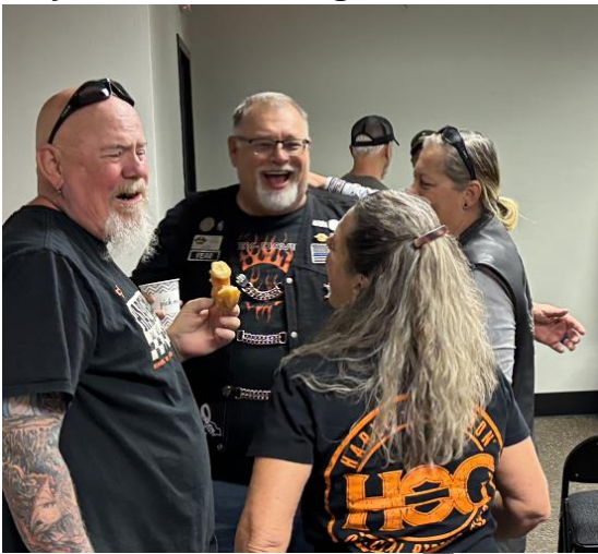
Gathering before the Meeting