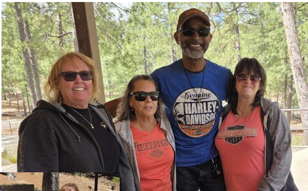
Our Smiling Setup Crew